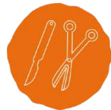
SOFT TISSUE SURGERY